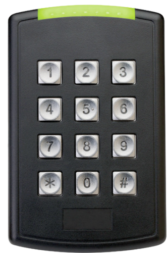
C2TACREADERKEYv4 Wall Mount Keypad (5.1" x 3.25" x 0.17")